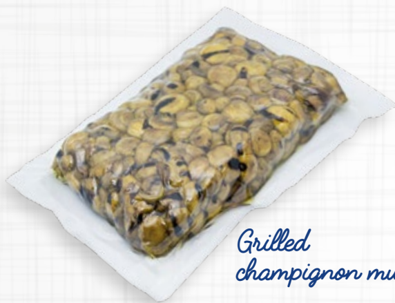
Grilled champignon mushrooms