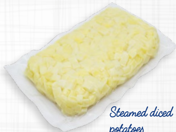
Steamed diced potatoes