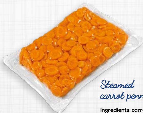
Steamed carrot pennies