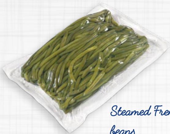
Steamed French beans