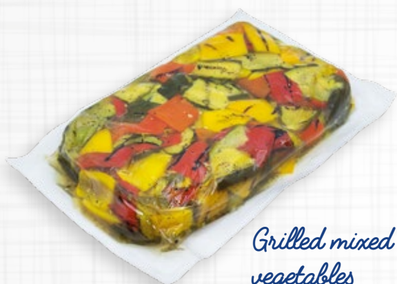
Grilled mixed vegetables

The Cottintavola pre-cooked range is also available in handy 1 kg and 4 kg packs for various uses in the Food Service sector and food industries .