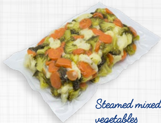
Steamed mixed vegetables

Ingredients: carrot pennies, broccoli and cauliflower