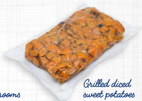
Grilled diced sweet potatoes