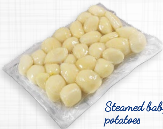
Steamed baby potatoes